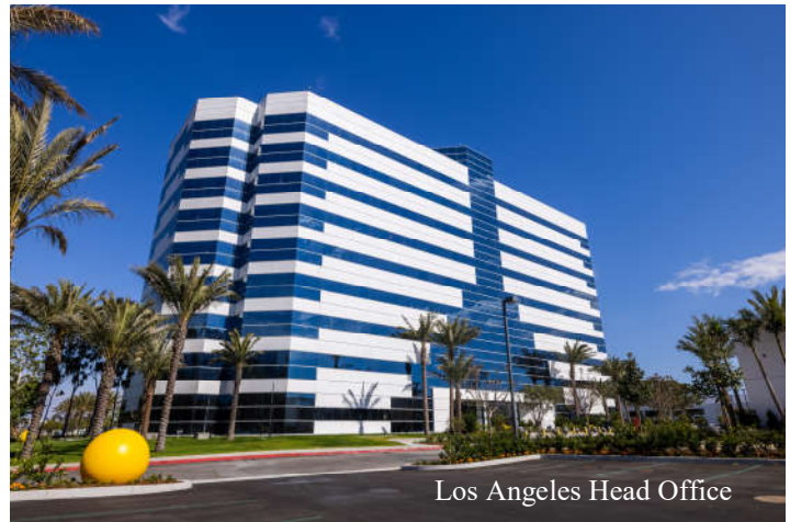
Los Angeles Head Office

PROFESSIONAL OUTSOURCING SOLUTIONS, INC. PAYROLL OUTSOURCING SOLUTIONS, INC. POSI ACCOUNTANCY CORPORATION